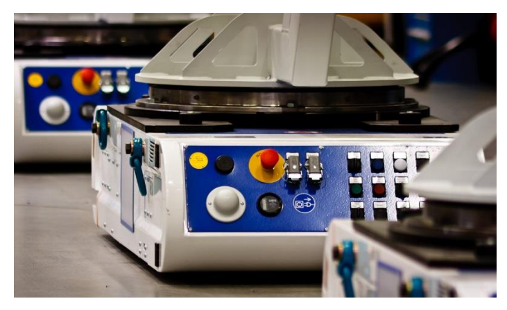
04 "nexy" wireless networks also have many benefits for AGV applications

transmission interval or the angle of inclination at which the sensor will emit a signal, can be configured in the software. Since in practice multiple sensors are often integrated within one wireless network, keeping the costs to a minimum was also an important factor during the sensor development.