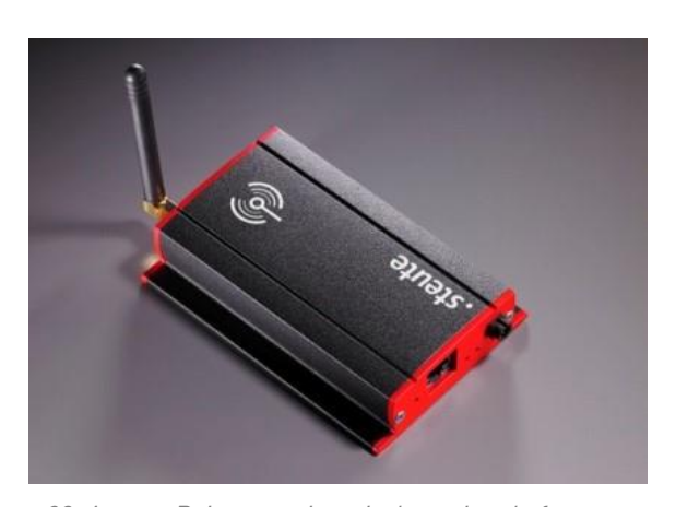
02 Access Points receive wireless signals from individual switches and sensors and transmit them to the customer IT infrastructure via e.g. WiFi or Ethernet

in turn made it possible to reduce stock levels without being in danger of running out – completely in line with the Japanese philosophy of "lean" production without waste. This principle is simple and practical – the reason why it has survived for so many decades.